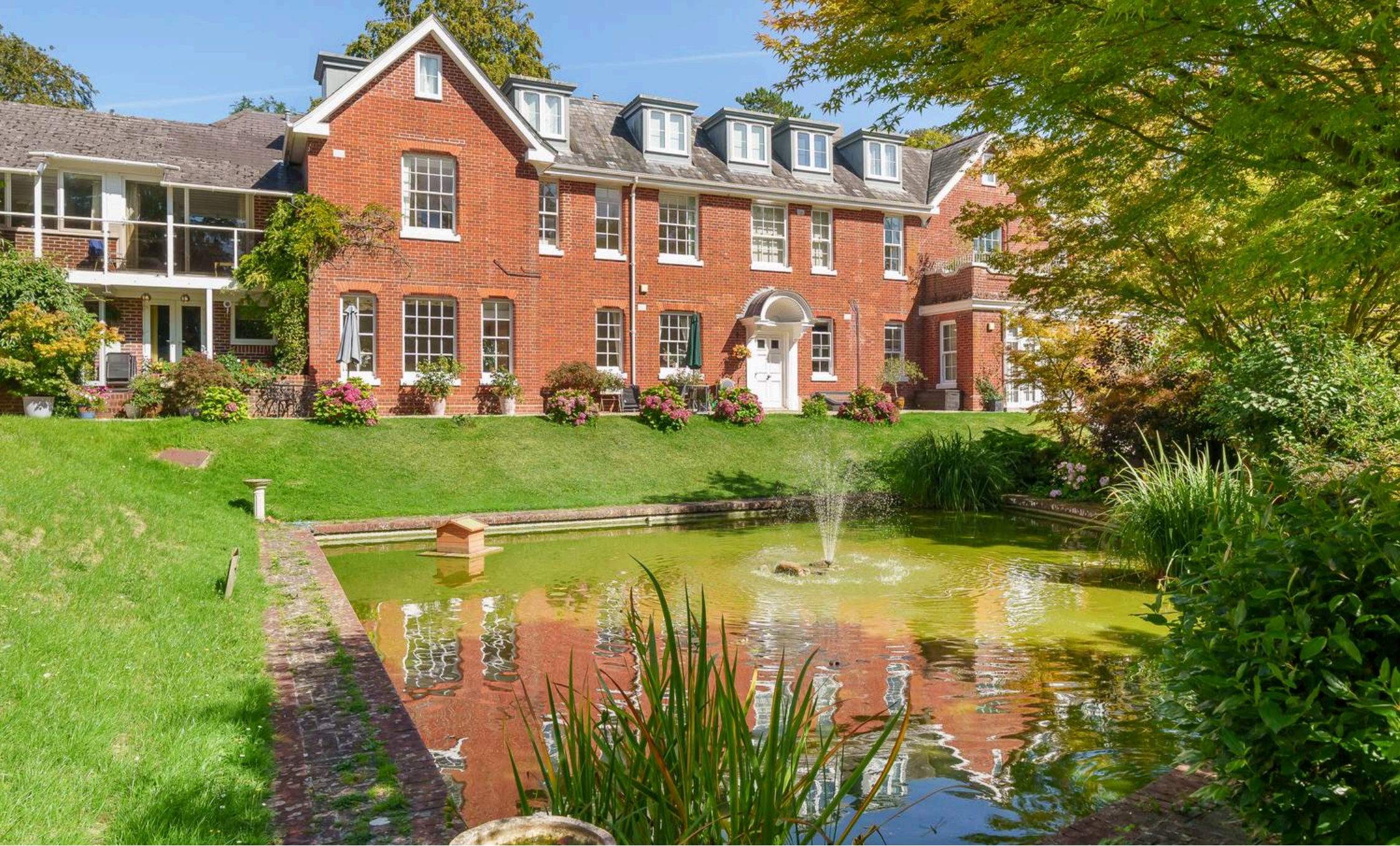
3 Little Dean House Winton Hill, Stockbridge Stockbridge